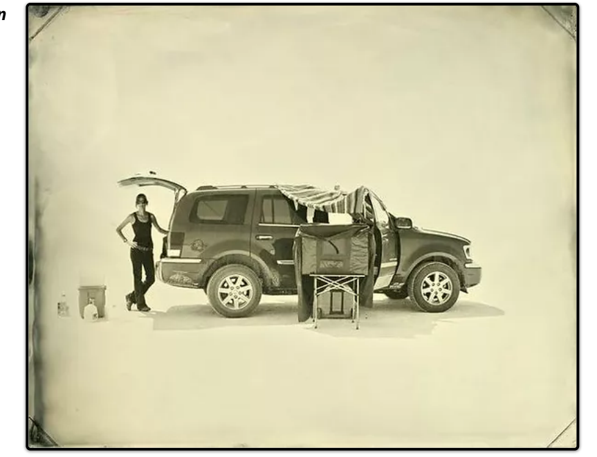
Homage to Fenton 8" x 10" unique tintype.