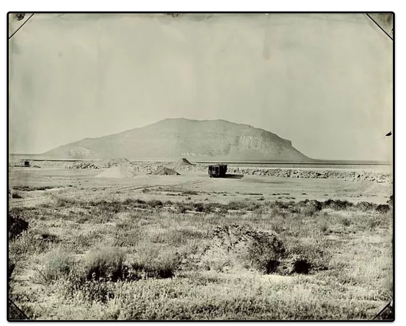
Lucin, lost train 8" x 10" unique tintype

Great Salt Lake 8" x 10" unique tintype.