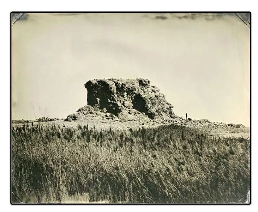
Obseravtion Rock 8" x 10" unique tintype.