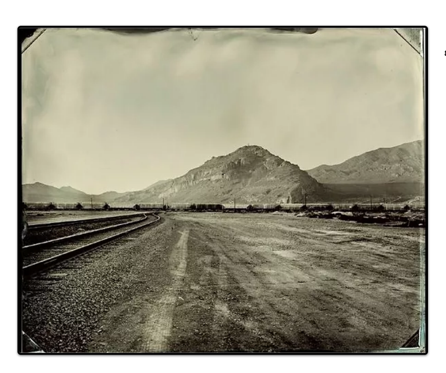
Tracks 8" x 10" unique tintype.