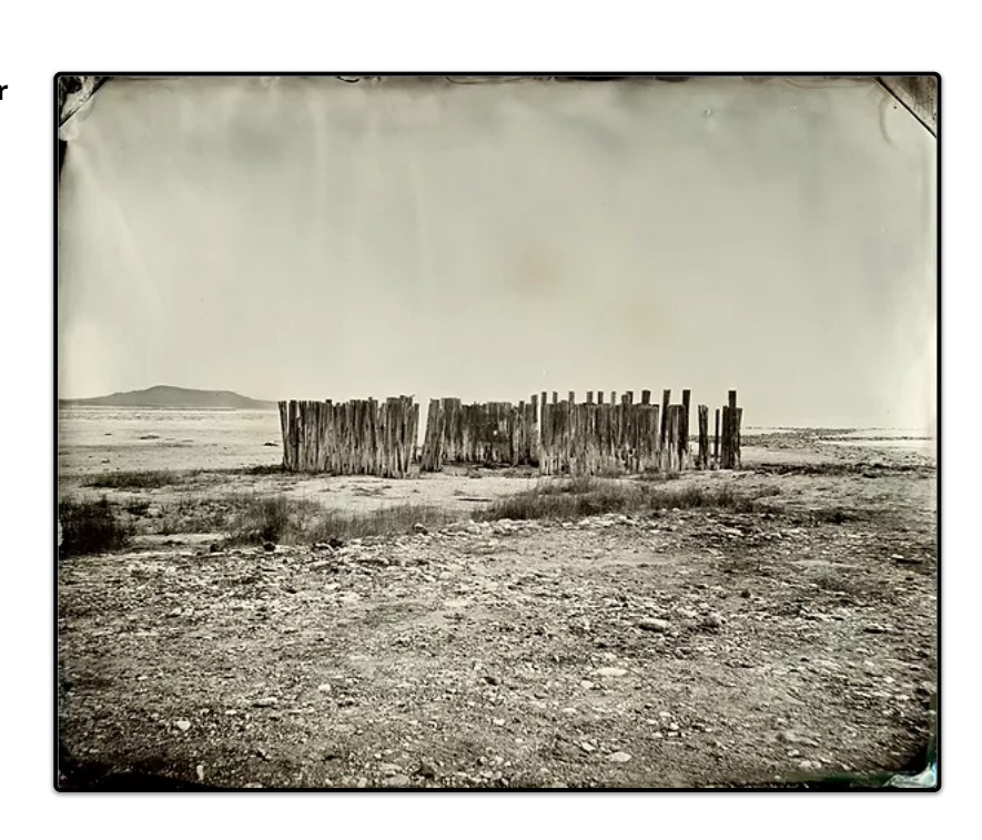
Myth and Matter 8" x 10" unique tintype.