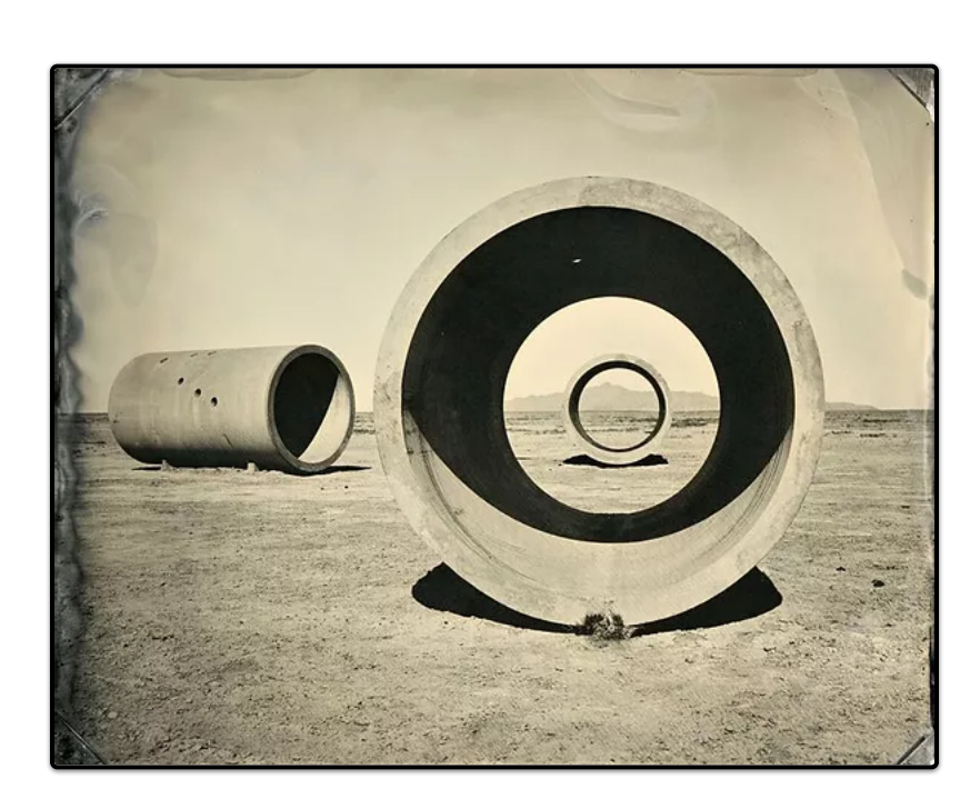
Sun Tunnels 8" x 10" unique tintype.