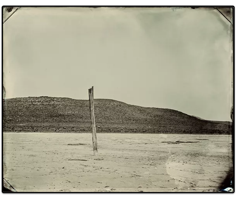
No Man's Land -- near Smithson's jetty 8" x 10" unique tintype.